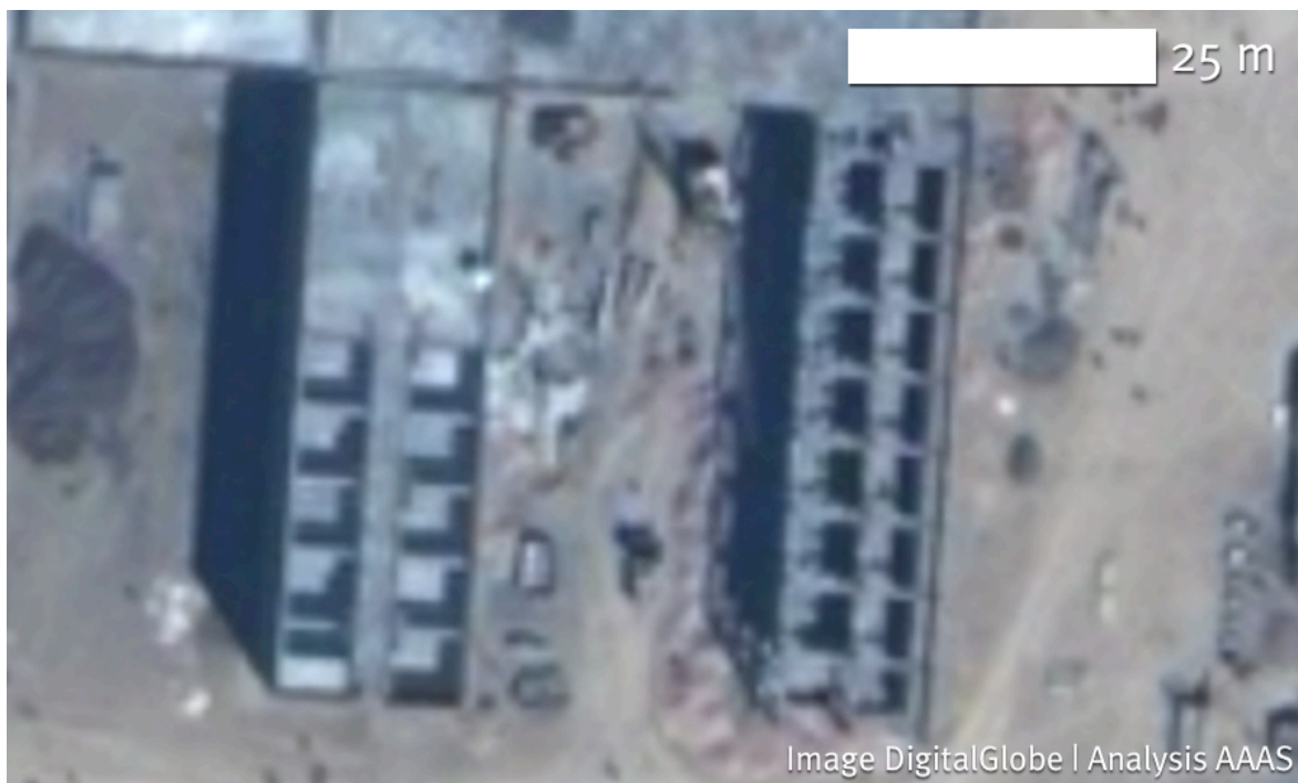
Figure 2. Close up of chambers (cells) revealed due to partial construction of the roof.