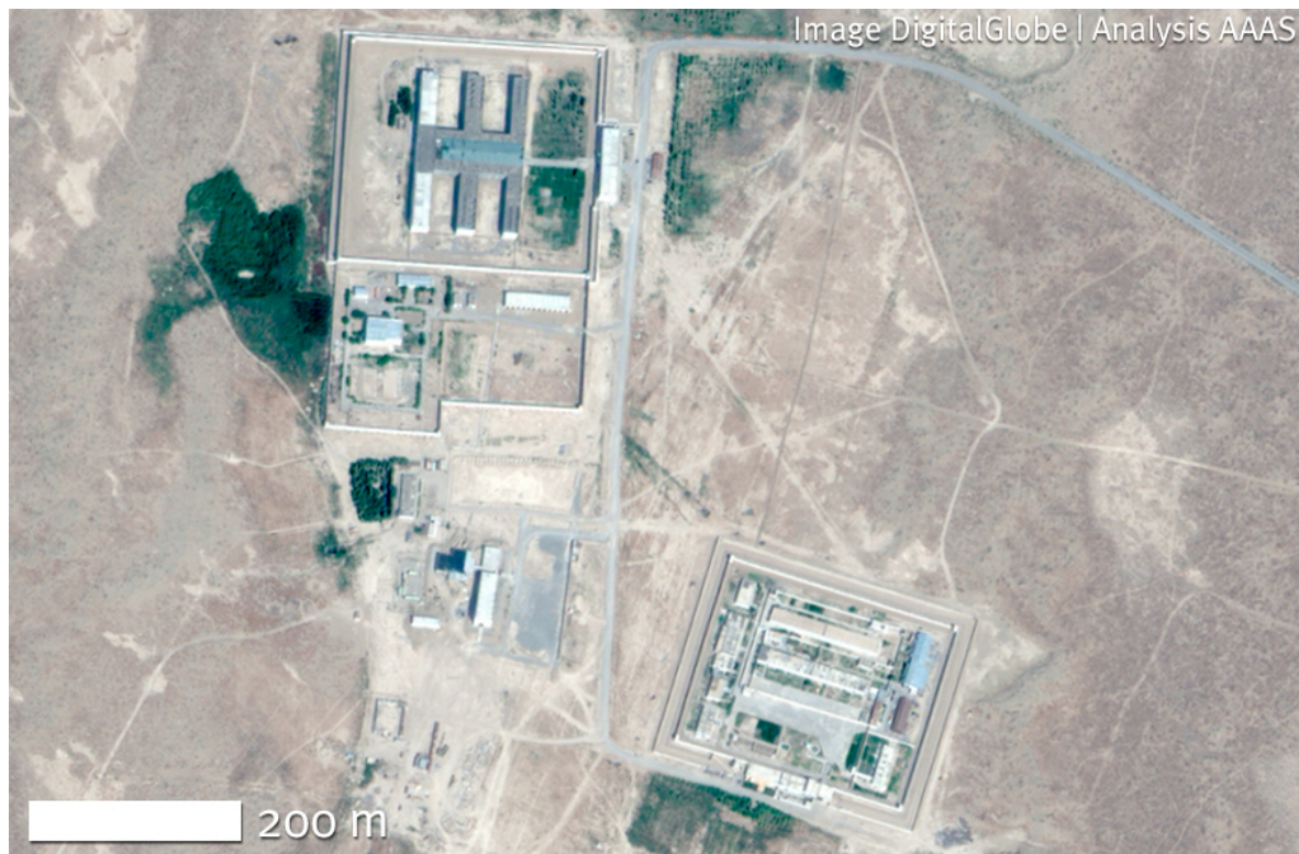
Figure 3. Completed prison complex in 2009.

In 2009, the satellite imagery showed the prison complex to be mostly complete, with some construction still ongoing in the south. An outer perimeter trench with a checkpoint is evident in the image, crossed by the access road, and a fenced, double-walled inner perimeter with guard towers surrounds the actual prison facilities, a potential administration building and barracks for the guards and support personnel. Only some of the possible cells viewed in the 2002 imagery were covered by the roofing in the 2009 images, with the majority being open, possibly intended for 'outdoor exercise' for the inmates. Those in the easternmost wing are further subdivided into smaller chambers of two different sizes: 3 x 3 meters and 6 x 3 meters. The prison structure is also observed to be three stories tall. There is no evidence of any damage or potential demolition of the prison complex following the death of President Niyazov in December 2006.