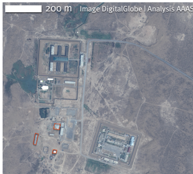
Figure 5. 2010 image showing Ovadan Depe has expanded further (red markings)

Imagery from 2010 shows that the prison complex continued to expand outside the maximum-security perimeter of the prison. This may have involved building additional facilities for support staff and guards. Such continued upgrading indicates that the Ovadan Depe prison is very much an ongoing and important part of the Turkmenistan penitentiary system and that the government continues to invest in it. The AAAS analysis of the imagery also indicates that a village of 107 settlements, which was located 5 kilometers northwest of Ovadan Depe in 2002 was completely abandoned in 2010. During Niyazov's presidency, there were rumors of forced displacement of the village. What happened to this village, whether displacement was forced or voluntary and under what conditions, is a question that can only be answered by the Turkmen authorities.