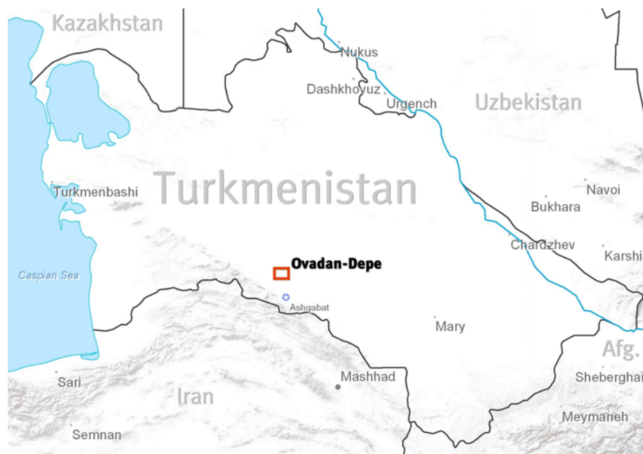
Figure 1. Ovadan Depe Prison Location.

The Ovadan Depe prison is a modern symbol of medieval torture and complete disdain for human rights. It is located in Turkmenistan, a country rich in natural gas, but with one of the worst human rights records in the world. Consistently ranked by various international organizations alongside North Korea and Burma, Turkmenistan is isolated, ruled by an authoritarian leader who has created a hideous cult of personality, and its government tolerates no independent thinking, never mind political opposition. 3 Ovadan Depe is not only meant to house inmates, but was designed specifically to terminally erode the physical and mental wellbeing of the political prisoners it contains. Ironically meaning "Picturesque Hill," Ovadan Depe may be one of the worst places in the world. Little is known about this prison, as the government of Turkmenistan refuses to disclose any information about its structure, or the condition of the prisoners incarcerated there. International monitors, including the International Federation of the Red Cross and Red Crescent, have never been allowed inside.