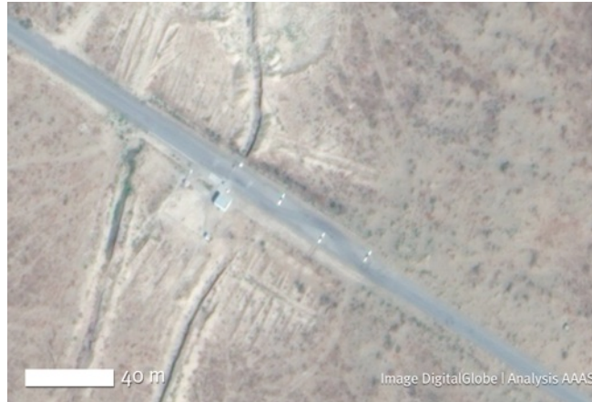
Figure 4. 2009 Outer perimeter checkpoint and roadblocks along access road

Imagery from 2010 shows that the prison complex continued to expand outside the maximum-security perimeter of the prison. This may have involved building additional facilities for support staff and guards. Such continued upgrading indicates that the Ovadan Depe prison is very much an ongoing and important part of the Turkmenistan penitentiary system and that the government continues to invest in it. The AAAS analysis of the imagery also indicates that a village of 107 settlements, which was located 5 kilometers northwest of Ovadan Depe in 2002 was completely abandoned in 2010. During Niyazov's presidency, there were rumors of forced displacement of the village. What happened to this village, whether displacement was forced or voluntary and under what conditions, is a question that can only be answered by the Turkmen authorities.