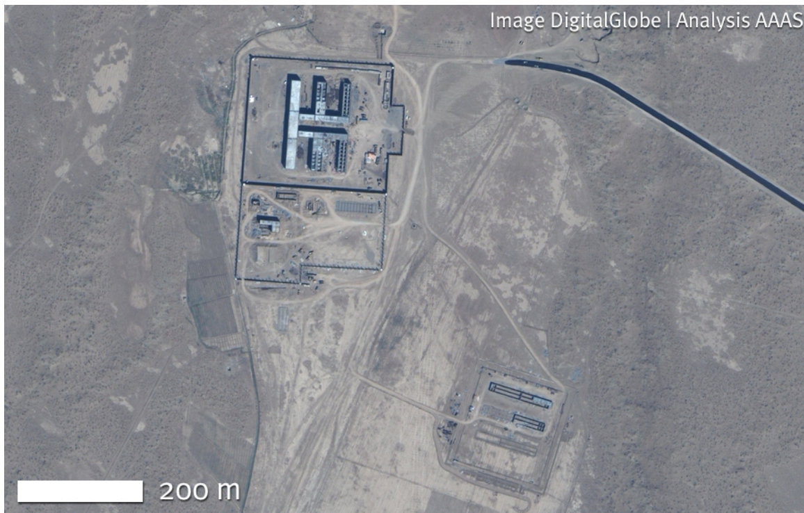
Figure 2. Ovadan Depe under construction in 2002.