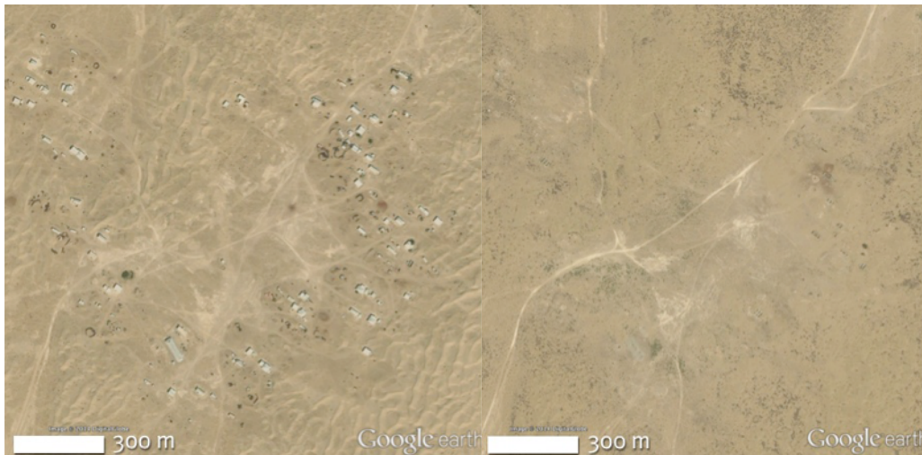
Figure 6. Village shown in image from 2002 (left) is gone from image of 2010.